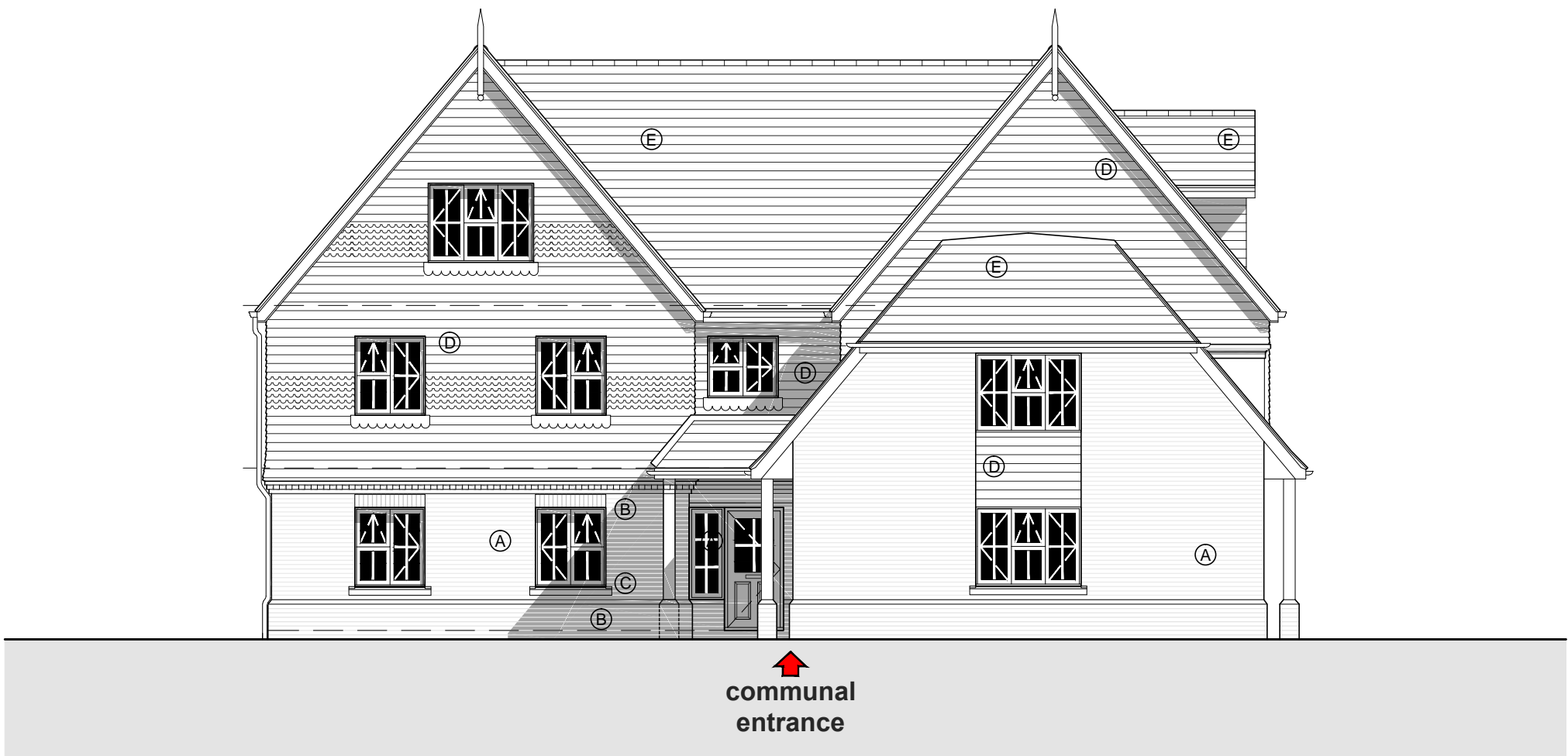
3 WEST elevation