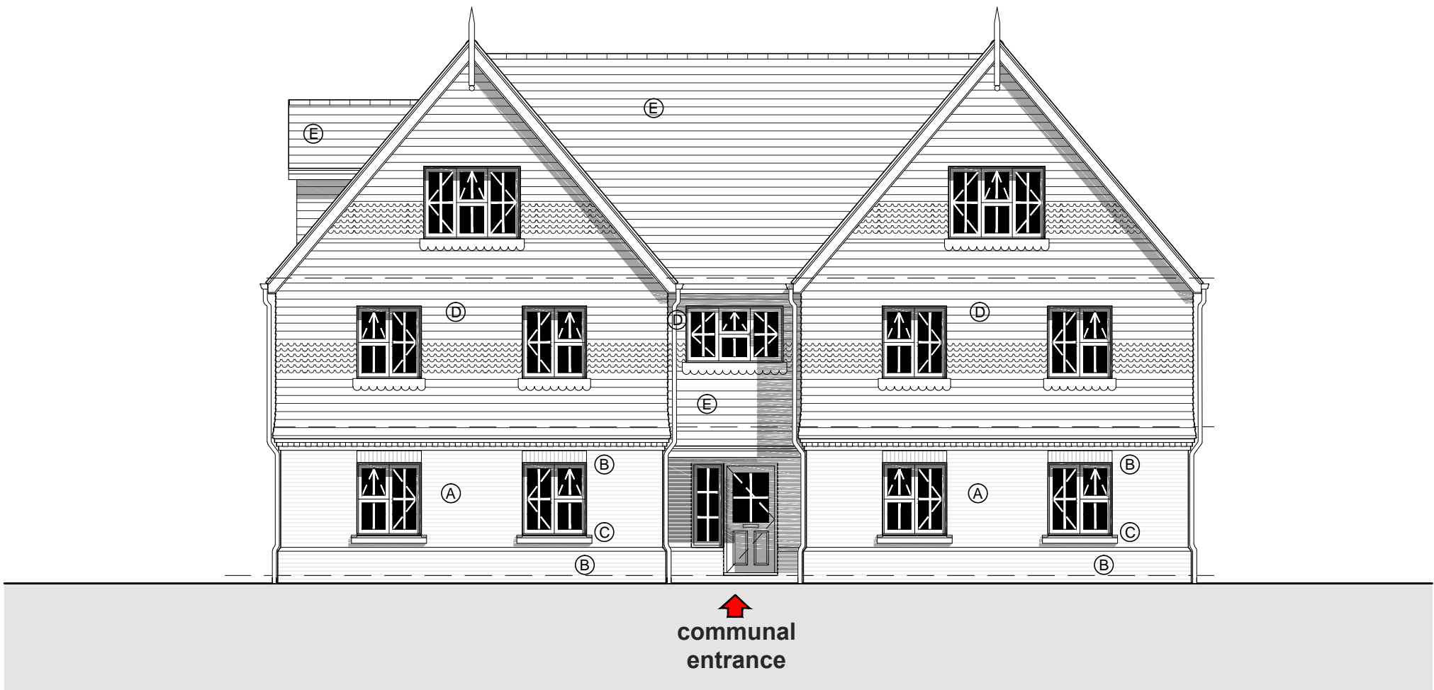
1 EAST elevation