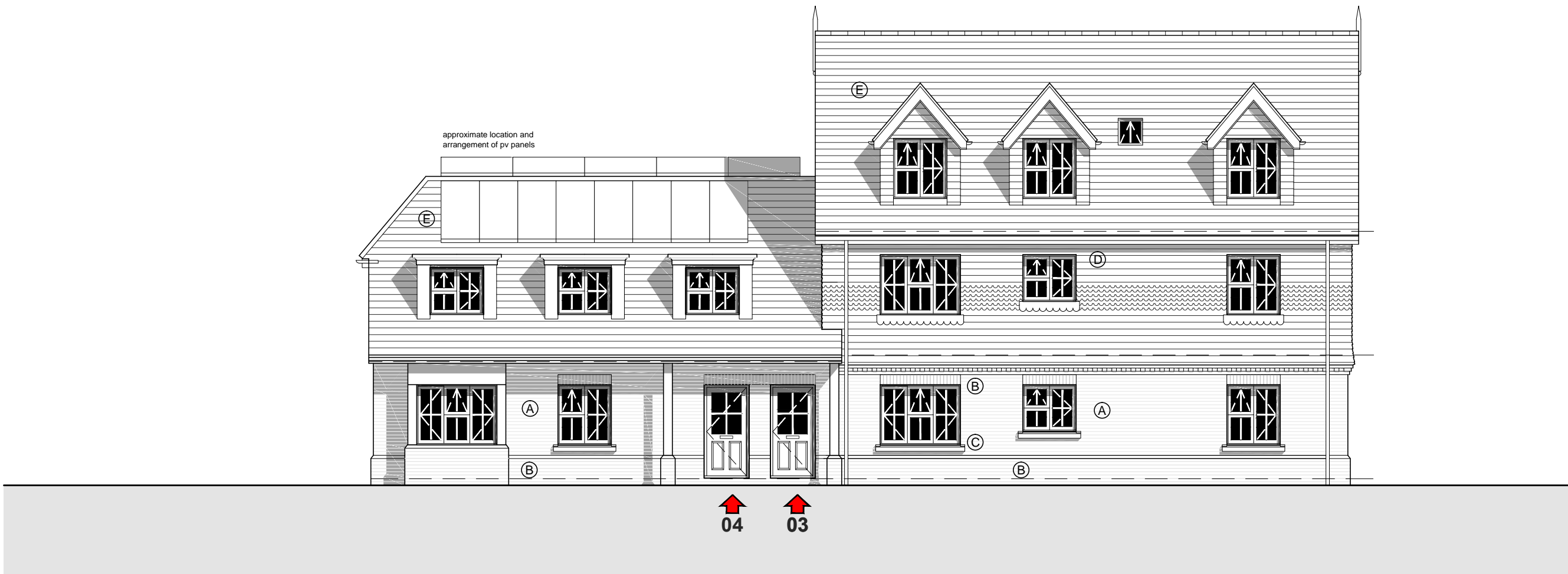
2 SOUTH elevation