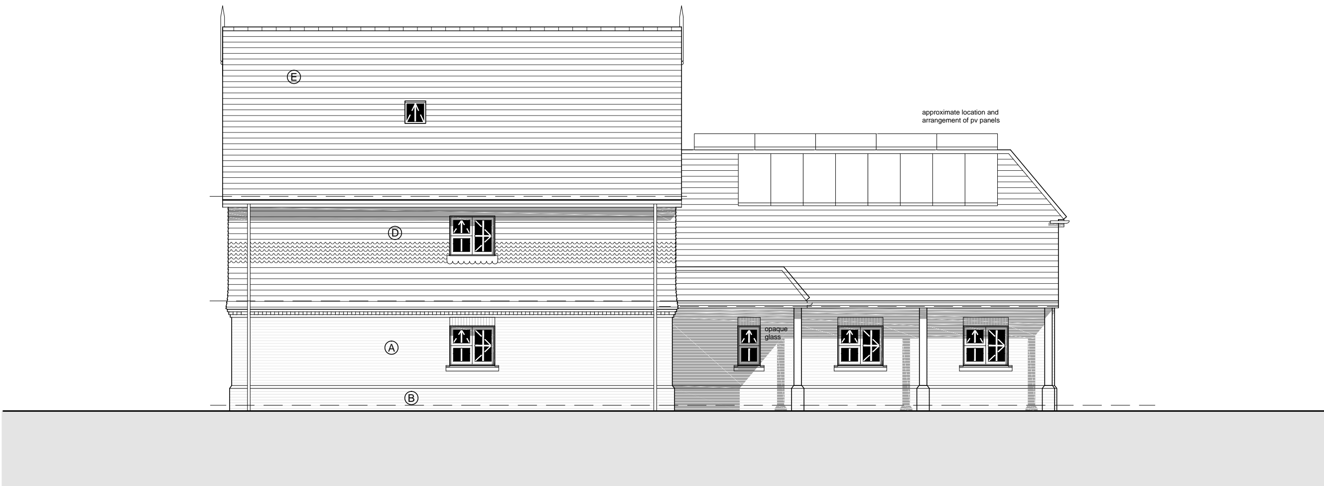
4 NORTH elevation